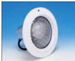
SP0580 Series Outside diameter of face rim: 10-3/4"

Models with suffix "L" are equipped with Automatic Thermal Switch (ATS). AstroLite Series light fixtures mount into DuraNiche Series niches only.