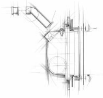
Hayward's DuraNiche Niche Series: engineered for superior performance, non-corrosive durability and plumbing versatility — plus the lowest installed cost. SP0607U DuraNiche for vinyl/ fiberglass pools (illustrated).

As the final traces of mother nature's brilliant sunshine disappear over the horizon until yet another morning, a whole new nocturnal world, full of quiet beauty and majesty drifts down from the stars and is known as nightfall.