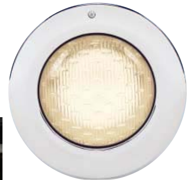
AstroLite Series light fixtures are available in a choice of face rim designs — from patterned thermoplastic (top) to smooth stainless steel (bottom).