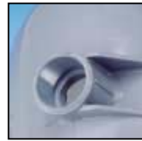
Socket conduit connection for simple gluing.

Reliability is further extended with DuraNiche's socket conduit connection. Designed for quick and simple gluing to PVC pipe, the connection provides a cleaner, more durable seal when compared to threaded-type conduit connections. Plus, the conduit hub is an integral part of the molded niche, which offers extra durability during installation.