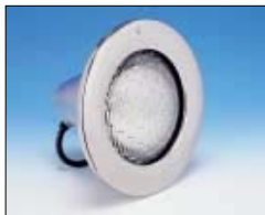
SP0580S Series Outside diameter of face rim: 10-3/4"