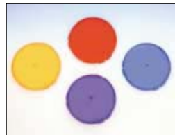
SP0580L Selecta-Color™ Lens Kit. Now change the mood of your pool at a moment's notice. Simply snap any of the four easy-to-change lens covers over the clear lens of the AstroLite fixture. No fixture removal or assembly is required.