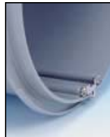
3/4" plaster flange with 90° "no slump" ledge.

For gunite and concrete pools, DuraNiche features a 3/4" set-back plaster flange with tie-off holes to secure to re-bar. This allows positive positioning of the niche during guniting and ensures a professional appearance in the pool wall. A cover-up plate is provided to protect the niche and mounting threads during guniting. Plus, a unique 90° ledge at the bottom of the flange prevents "slumping" during plastering.