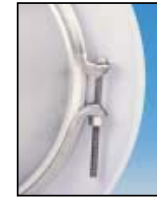
E-Z Lock clamp and reflector assembly.

They feature a convenient E-Z Lock™ clamp and reflector assembly for simple relamping. And, they come standard in a wide range of voltages, wattages and cord lengths to satisfy virtually any installation.