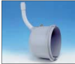
SP0600U Front-to-back: 7-15/16"